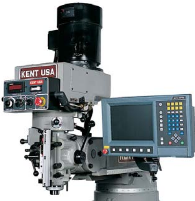
KTM-4VKF with MillPwr-2

Position-Trac scale has absolute encoder technology. This allows MillPwr control to find machine "home" position in any axis by moving only up to 2" of travel. Once homed, work piece datum is established and the control can repeat a position even after being powered off. As an added benefit, software limits can be set to safely keep machine travel within machine travel limits without the need of additional hardware limit switches and home switches.