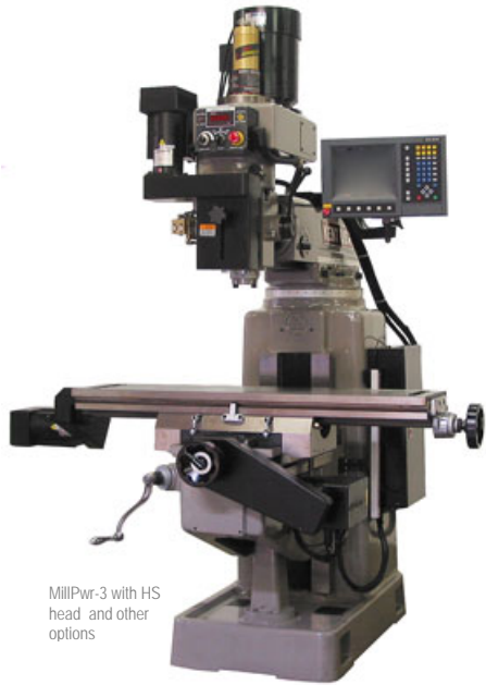
MillPwr-3 with HS head and other options

CNC Knee Mill: KTM-5VKF-MillPwr-2axis KTM-5VKF-MillPwr-3axis